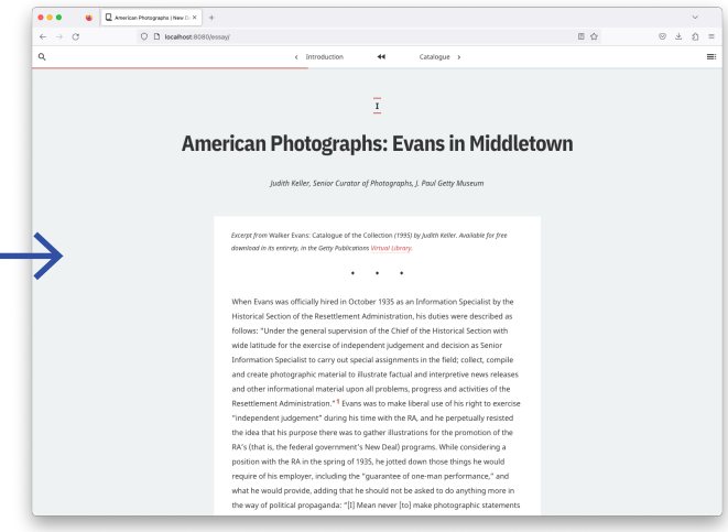
that Quire transforms into a website, PDF and e-book

View publications from our community: https://bit.ly/quire-showcase